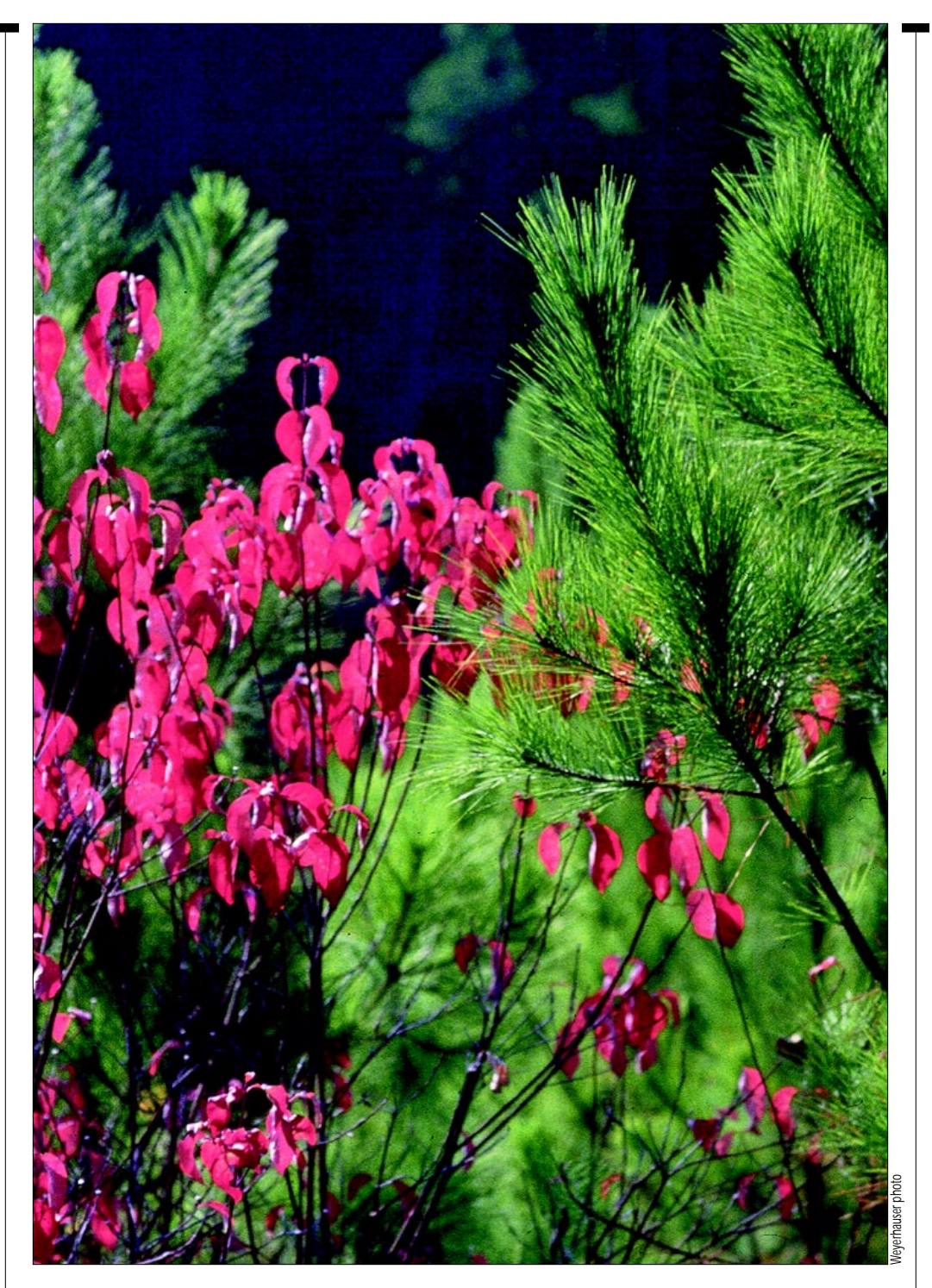
A variety of plants are found along the upland-bottomland interface.